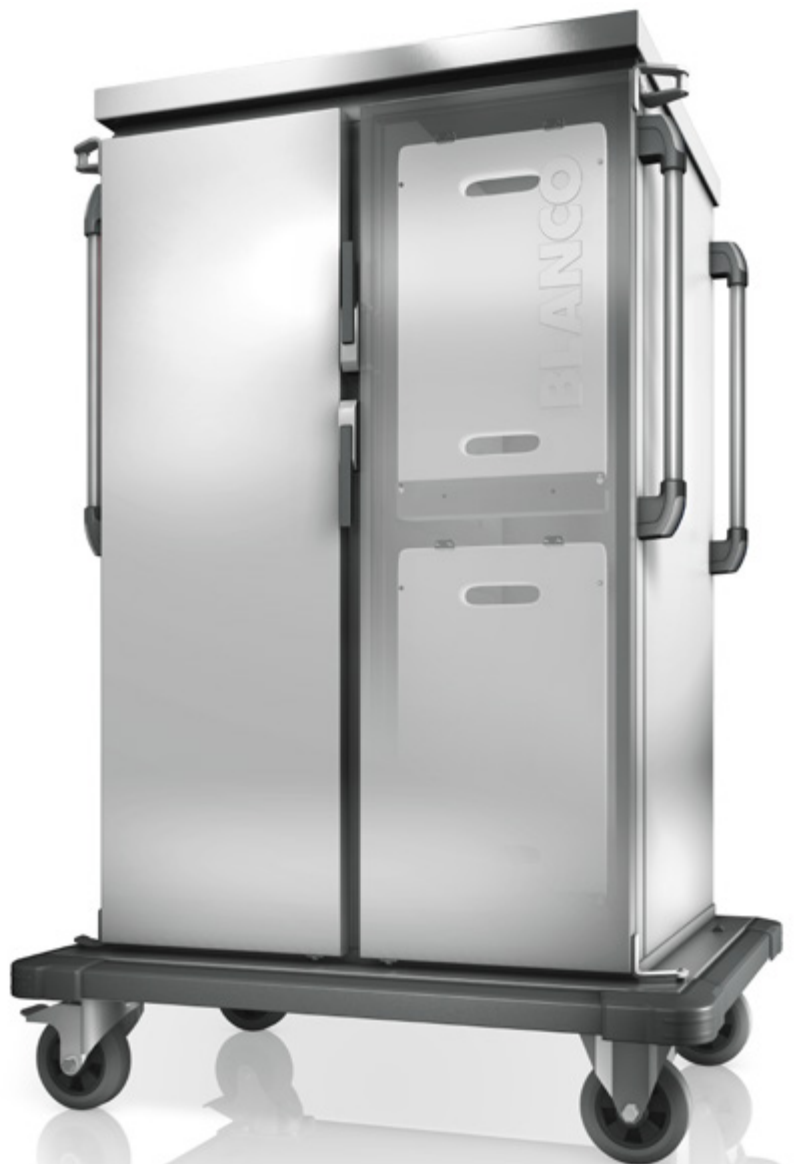
TTW-PK 20-115 DZE Tray transport trolley, for passive cooling with eutectic plates, double-walled, insulated, for Euronorm trays

What this means for customers: no undesired air exchange between the compartments, better temperature maintenance, fast access to the cooling elements, easier cleaning and better hygiene – because B.PRO always thinks ahead.